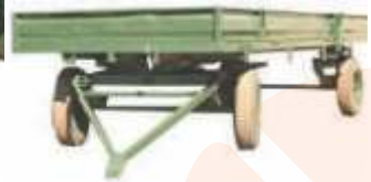
STEEL DECK WITH DROPSIDES